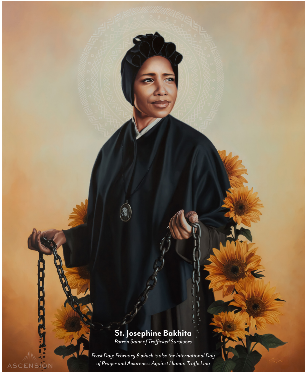
St. Josephine Bakhita

in response to the CCCB Pastoral letter on human trafficking and sexual exploitation in Canada , “For Freedom Christ Has Set Us Free”