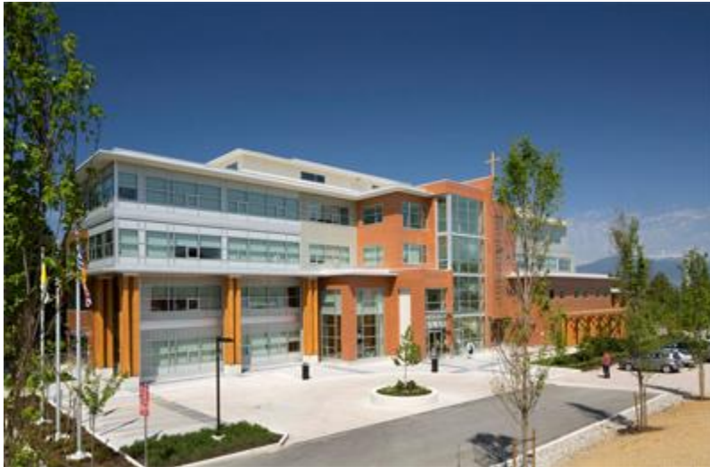
New John Paul II Pastoral Centre, located on 4885 Saint John Paul II Way.

After nearly 60 years in Vancouver's downtown core, the Archdiocese of Vancouver moved its administrative offices to the 33rd and Willow area on the site of a "Campus of Care" being developed by Providence Health Care.