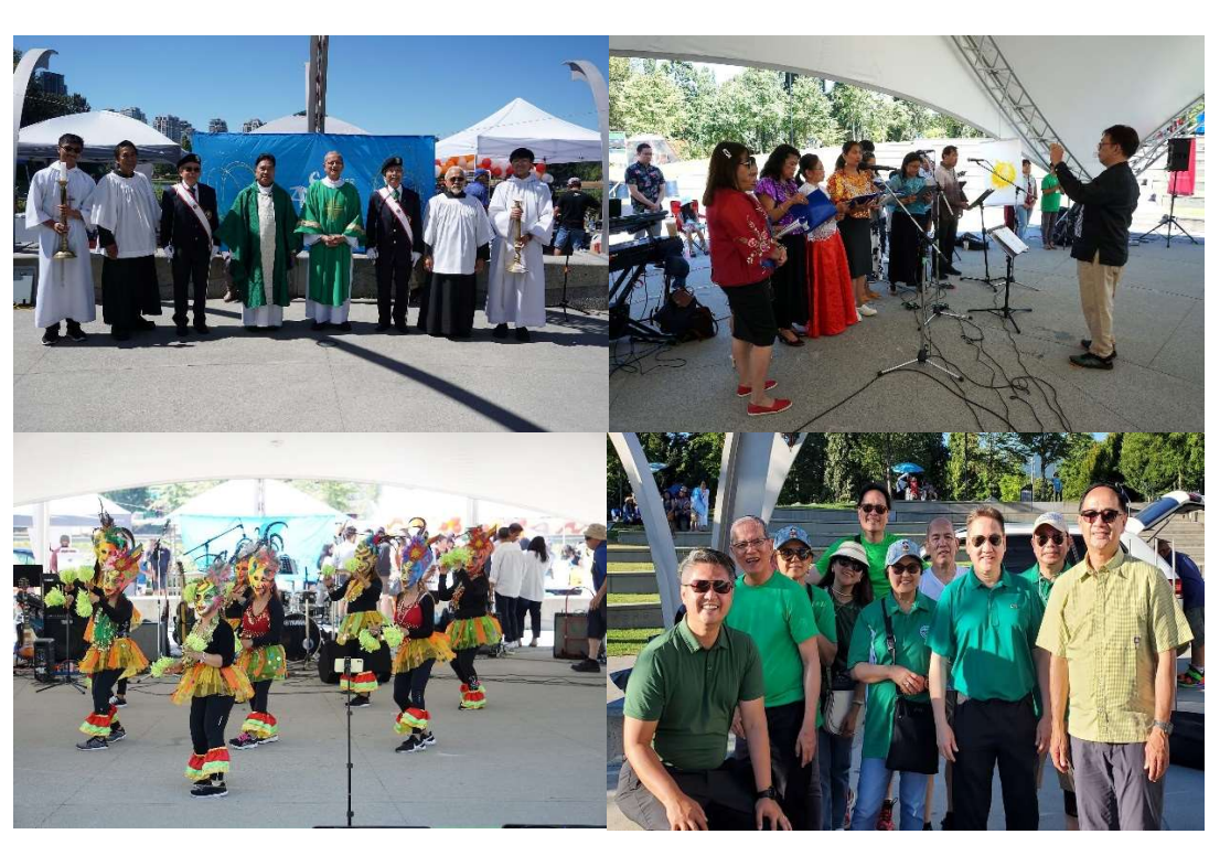
Summer Music and Arts Festival held at Coquitlam Town Centre Park (August 2022)

This includes working with Filipino pastors to better understand the need of their Filipino parishioners. It also includes having a council of Filipino Catholic Associations to improve coordination and their involvement in parish life and the evangelization efforts of the Archdiocese. There is also the creation of a missionary discipleship formation program for Filipino leaders. Plus, hosting periodic large-scale events to celebrate the Filipino community's contribution to the Archdiocese.