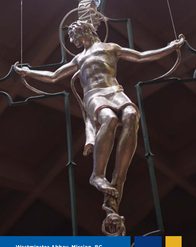
Westminster Abbey, Mission, BC