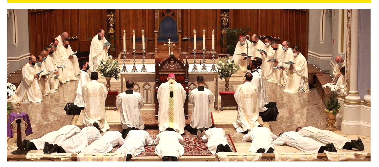
Three Filipinos out of nine new Deacons ordained last October 7, 2021, at the Holy Rosary Cathedral